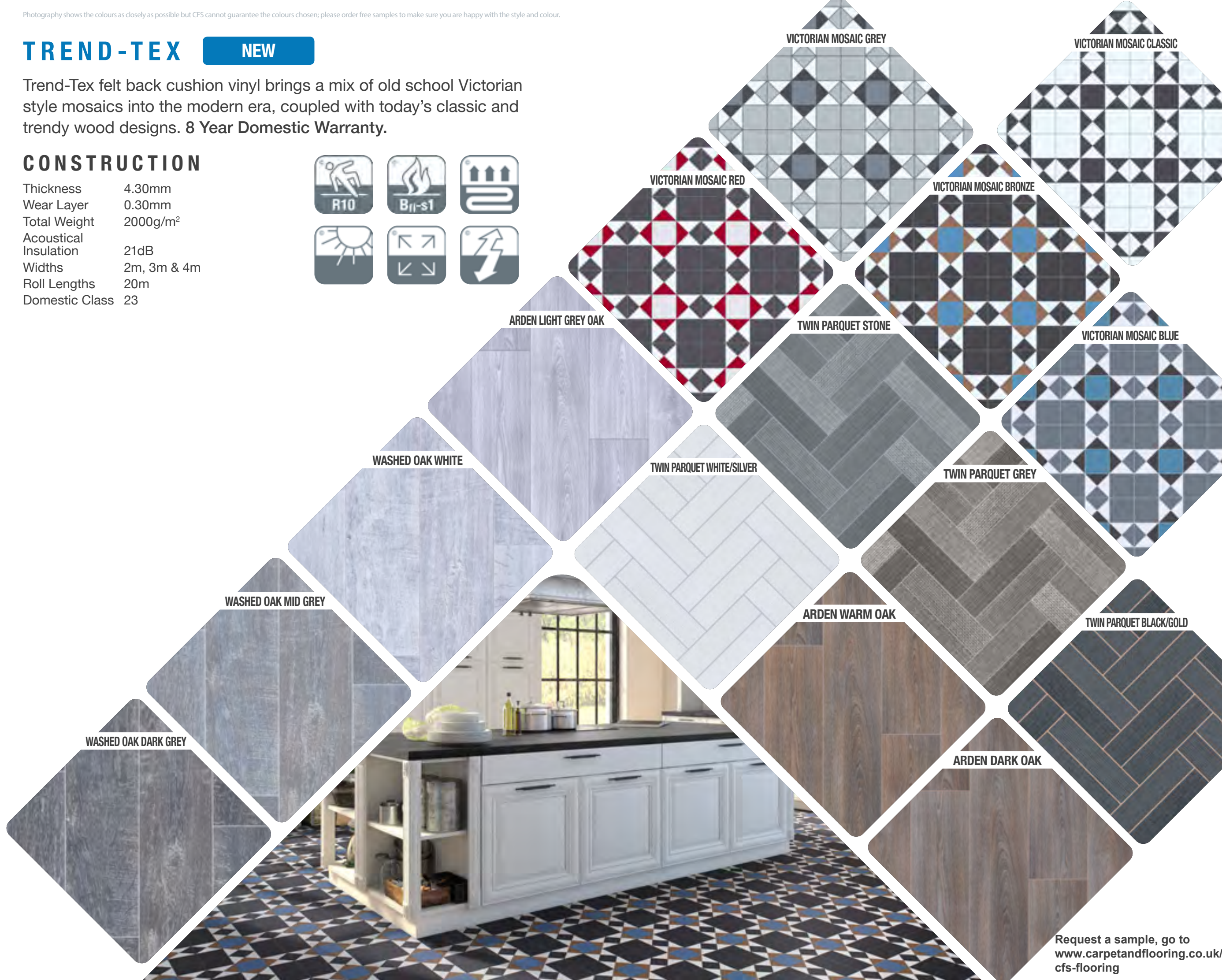
VICTORIAN MOSAIC GREY